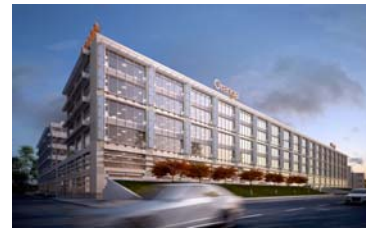
Polish Telecoms HQ Warsaw, Poland Office property sale USD$191,000,000