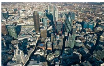
Aviva Tower London, UK Office property acquisition $470,000,000