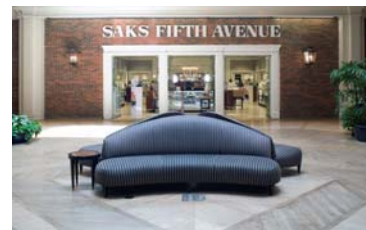
Plaza Frontenac St Louis, USA Retail property sale $135,000,000