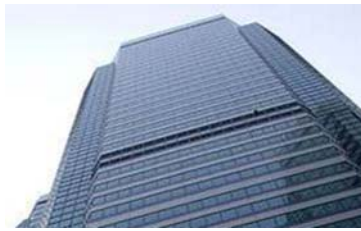
PCCW Tower Hong Kong Office property sale $565,000,000